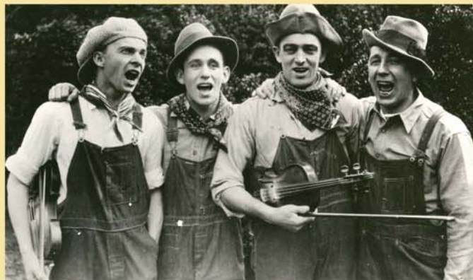
The Hill Billies

The Rex Theater and many jam sessions in Galax offer music by local artists. Only "Two songs away from Galax" is the Blue Ridge Music Center, at milepost 213 on the Blue Ridge Parkway. The Center is home to live music performances and historic exhibits. The New River Trail State Park is a 57 mile walking, bicycling, and equestrian trail that showcases a variety of scenic locations including Foster Falls and Chestnut Creek Falls. The river offers fishing, rafting, and canoeing opportunities for the outdoor enthusiast.