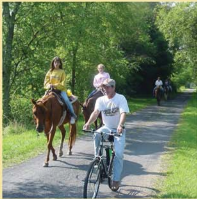
New River Trail